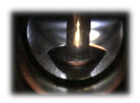
Figure 1. The view inside the tube, using the integrated camera. The probe is dispensing the sample into the tube.

Dry steps were optimized by using the integrated camera. Optimization of the ash and atomize temperatures (see Figure 1) was done using the using an intelligent chemometric method, included in the instrument software (the Surface Response Methodology tool). Tests were performed on a standard reference material and on a spiked water sample. All measurements were made using the Peak Area calculation.