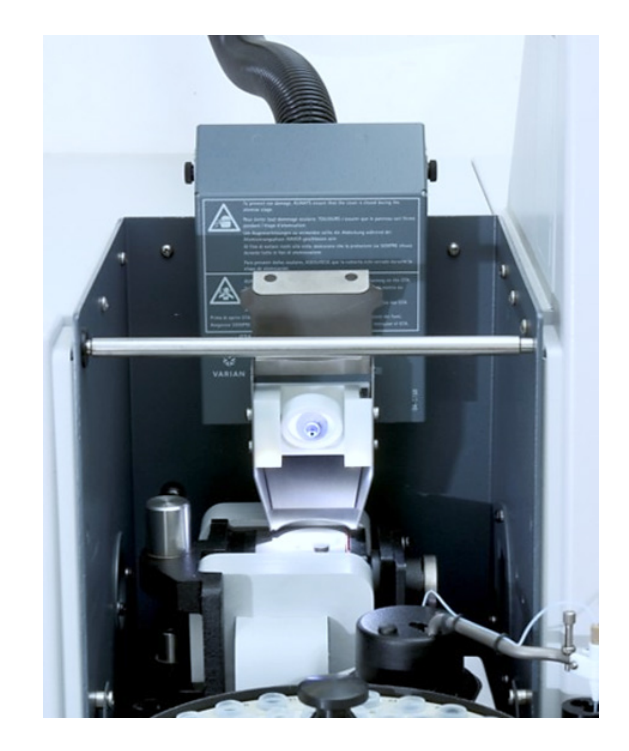
Figure 3. The optional extraction/LED accessory for the Agilent furnace.

The optional fume extraction accessory (Figure 3) includes an LED lighted mirror to provide a clear view of the graphite tube injection hole. Alignment of the autosampler capillary is worry-free while the exhaust system removes ashing vapors at their source. The extraction accessory provides flexibility of the furnace placement eliminating the need for direct position under the exhaust fan.