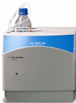
Agilent PL-GPC 50 Integrated GPC/SEC System

The Agilent PL-GPC 50 Integrated GPC/SEC System is a standalone instrument containing all the components necessary for the analysis of a wide range of polymers. With pump, injection valve, column oven and optional degasser, as well as any combination of refractive index, light scattering and viscometry detectors, the PL-GPC 50 is an ideal choice when you are starting out in GPC or want the convenience of a single solution.