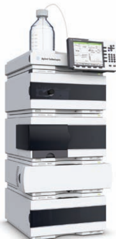
Agilent 1260 Infinity GPC/SEC Analysis System